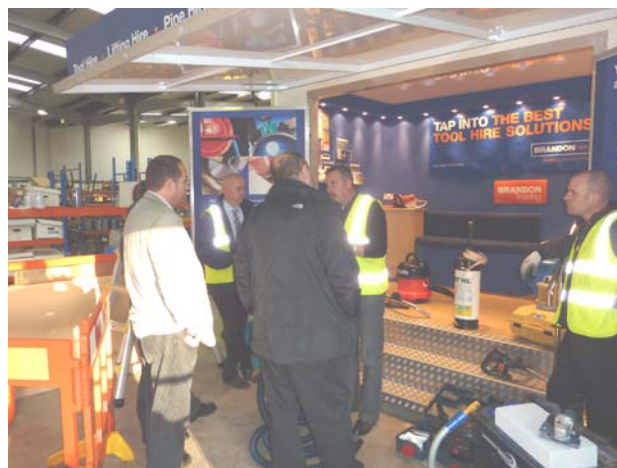
Visitors at the Brandon Hire Trailer