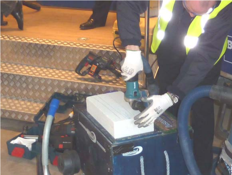
Close-up photo of the dust control suction casing on an angle grinder with disc cutting a thermal block.

to come up from Bristol to stage the demonstrations. In addition, we had a representative from the well-known vacuum cleaner supplier, Dust Control Ltd., to present further demonstrations.