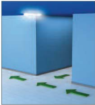
Near each intersection