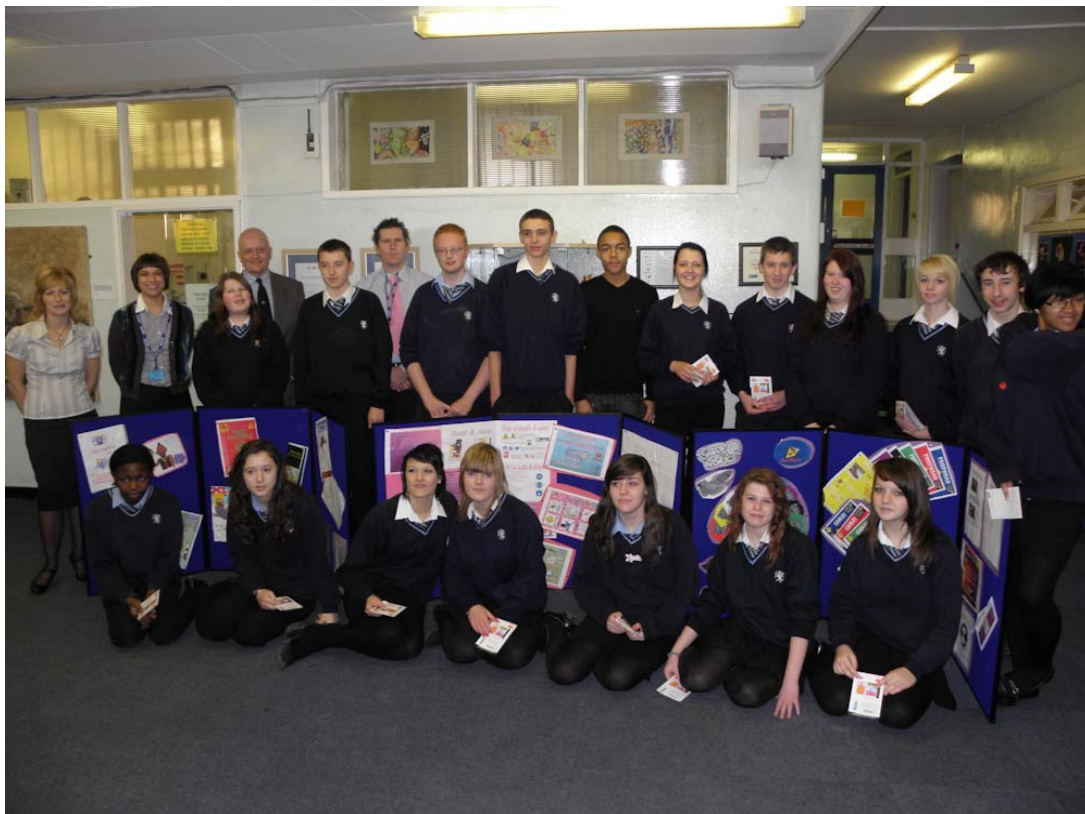
Some of the winning pupils with a selection of their entries