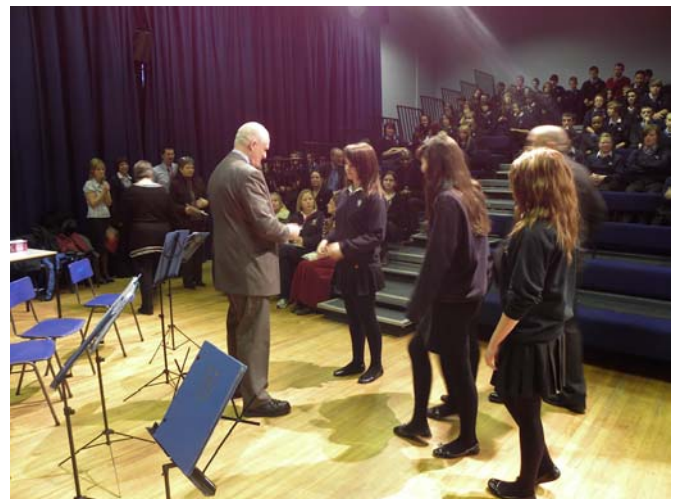
BHSEA Secretary presenting awards to some of the winning pupils at morning Assembly.

The competition attracted an impressive set of entries from the pupils, which indicated an excellent response to the awareness training. The entries were judged by BHSEA, BCC and HSE representatives and BHSEA provided 25 WH Smith £10 Vouchers to pupils contributing to the winning entries. It is hoped to expand the initiative into other Birmingham Schools in 2010.