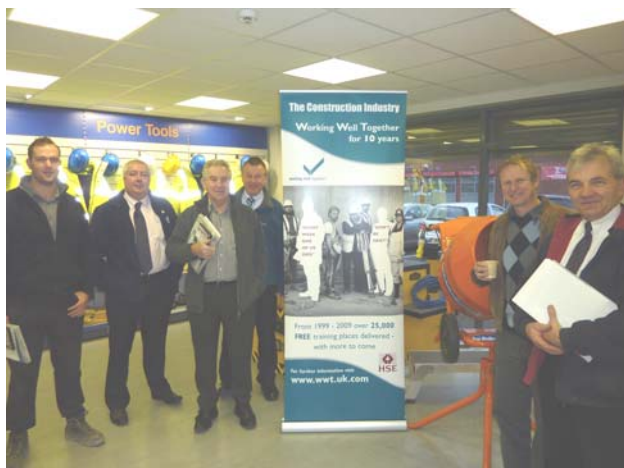
A selection of visitors on the second day

On the days of the event we had a display to attract the attention of passing customers but relied on invited delegates for the demonstrations and awareness training. The Brandon Hire facilities are excellent and they also arranged for their Training Trailer