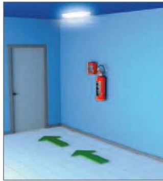
Near fire fighting equipment

Another significant area of lighting design is Emergency Lighting, which is treated as an individual requirement. The photographs show the salient positions for locating the luminaires, once the escape routes have been determined in accordance with the Building Regulations and the Fire Risk Assessment. As a general rule,