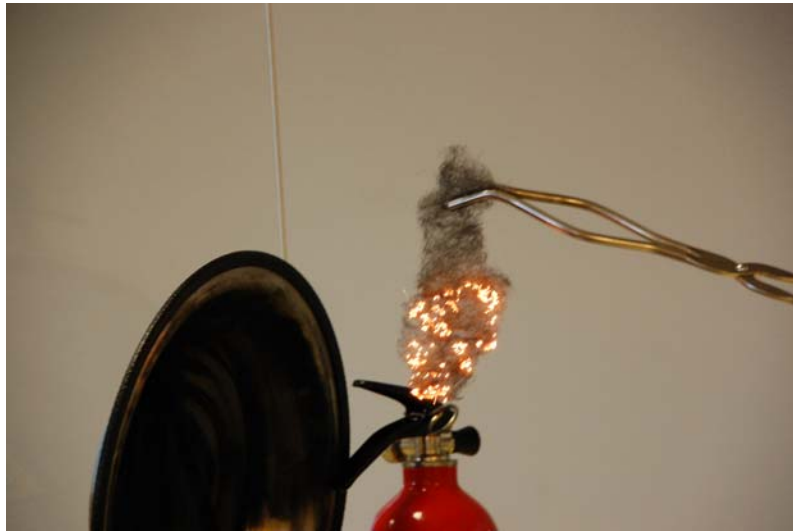
Contact between battery and steel wool

Another source of fire from increased surface area arises if materials like fine steel wool and electrical storage batteries are disposed of in the same waste container. There is often as much as 7% of the energy left in a spent battery, which is enough to