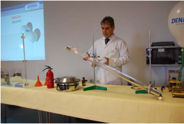
A mobile explosive gas hazard!

on the part of individuals to the potential hazards around them, better training but, predominately, by the person controlling the overall programme on site, especially when priorities may be subject to last-minute changes from day-to-day! Roy demonstrated this effect very nicely by pouring ether down this tube, towards the naked flame at the bottom to produce another satisfying, but safe, BANG at the top as the flame tracked nicely upwards! He quoted a recent example of this effect in Lincolnshire, where a LPG leakage tracked over 1 mile along an irrigation ditch to a tractor being used on clearance work, which caused an explosion.