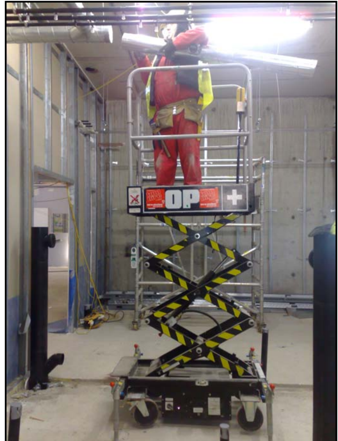
The 'Pop Up Plus