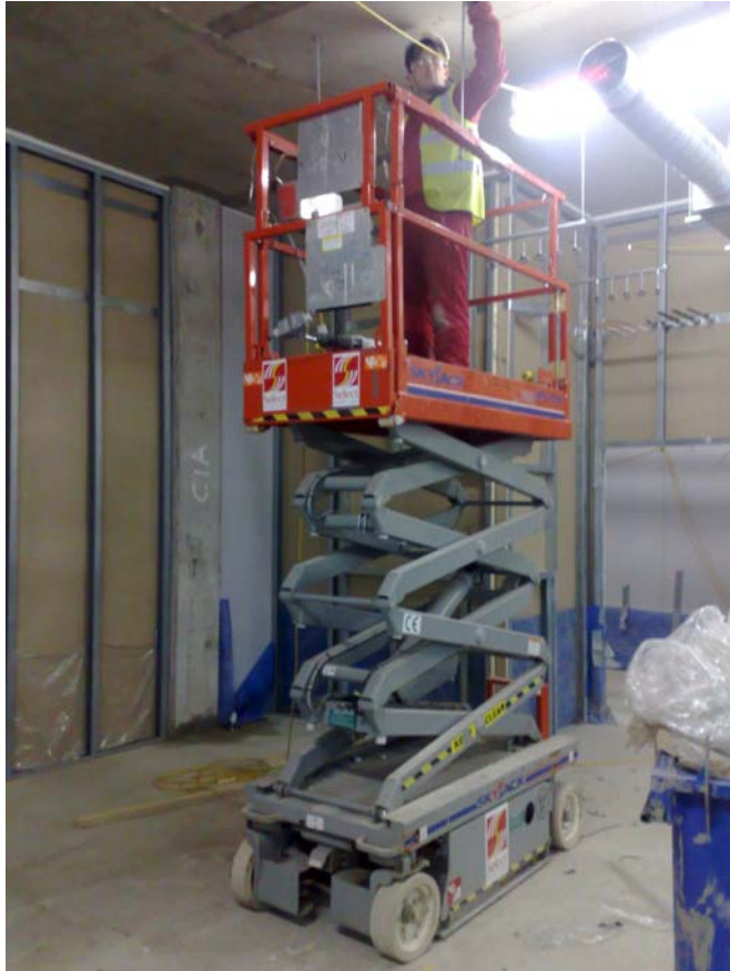
The 'Skyjack' self-propelled MEWP