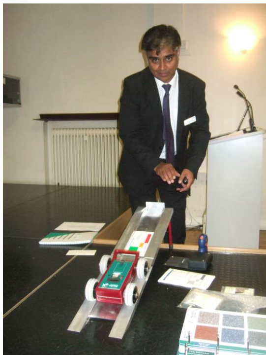
Figure 1 Dally demonstrates the Slip Alert Tool.

Dally continued by explaining that flooring falls within one of two categories: soft and hard. With regard to slips trips and falls (STF's), the important aspect is to measure how much resistance the floor material provides by measuring the friction level and its roughness. Dally went on to demonstrate a device called a 'Slip Alert Tool' (SAT). (See Figure 1):